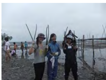
Afforestation of mangrove

In the Philippines, participants obtained information on the national government's environmental policies and NGO/NPO activities in the Philippines at the Department of Environment and Natural