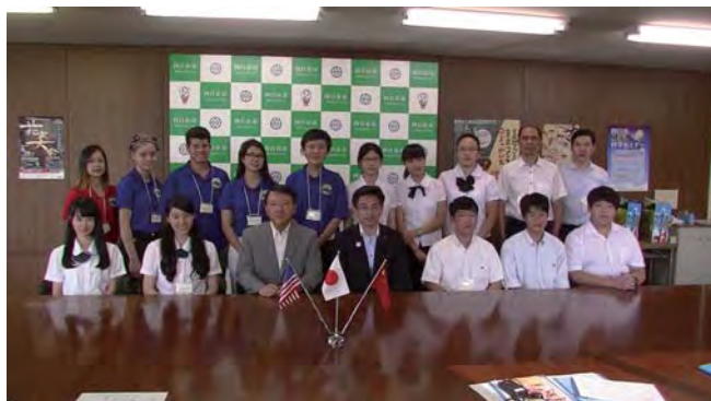
Courtesy visit to the mayor of Yokkaichi City and the president of the City Council