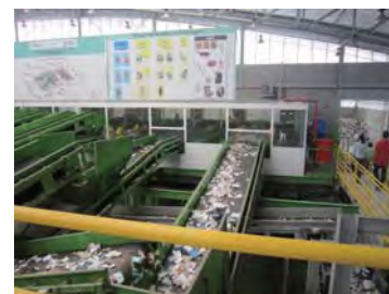
Automatic Waste Sorting and Disassembly Center

We visited Sao Paulo's state government bodies, such as the Environment Bureau, the Sao Paulo Water and Sanitation Company (SABESP), the Sao Paulo Industrial Federation (FIESP), and an environmental disposal facility to conduct a survey to ascertain the current environmental situation in Brazil.