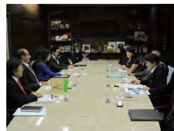
Sao Paulo Industrial Federation (FIESP)

In this survey, we were able to confirm that there are environmental needs in broad fields, such as water quality improvement at water sources as a measure for water shortages, measures for domestic wastewater to be