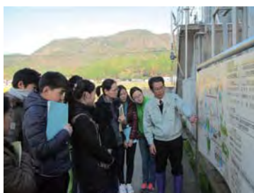
Study tour of renewable energy based on livestock feces and urine (Biomass utilization facility)

In the training, participants not only acquired various types of knowledge, including a lecture on overcoming the Yokkaichi pollution problem, a lecture presented at the Tokyo Metropolitan Government Office, and studying in a university about the evaluation of developmental neurotoxicity with Zebrafish as an indicator, but also went on study tours of facilities for environmental analysis