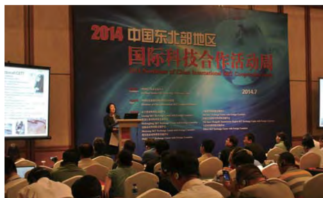
Making a presentation in Shenyang, before participants from Liaoning Province, the UK, Italy, South Korea, and Japan