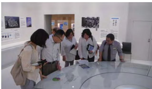
Yokkaichi Pollution and Environmental Museum for Future Awareness

We introduced ICETT's activities to administrators of municipalities inside and outside the prefecture, residents and citizens of the prefecture, persons with relevant knowledge and experience, researchers, and students, for dissemination