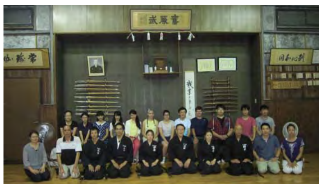
Hands-on cultural learning of "iaido" (the art of drawing a Japanese sword)

I hope that the students, who are the bearers of the future of their respective cities, through the friendships formed in this Environmental Summit, can continue their exchanges also in the future, contribute to the improvement of the environmental problems of the friendship city of Tianjin, the sister city of Long Beach, and Yokkaichi City in the future, and play active roles as human resources who can serve as a bridge of friendship between these three cities.