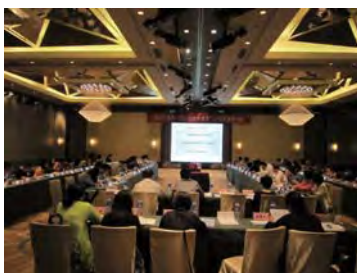
Seminar in Tianjin

(1) Hold an environmental preservation seminar in Tianjin City For two days on September 16 and 17, 2014, we held a local seminar under the theme of "Environmental Air Quality Improvement" in Tianjin City. The local seminar began with "Overview of Monitoring Tianjin City's Environmental Air Quality," a presentation from the Tianjin City side, which was followed by "Yokkaichi City's Air Pollution Abatement Measures," a presentation by Yokkaichi municipal government officials. After that, both Japanese and Chinese sides made presentations on "Measures for Atmospheric Environment in Japan," "Hypothetical Reasoning and Preventive Measures Related to Microparticulate Contamination Substances in Tianjin City," "Recycling and Utilization Technologies for Biomass Solid Waste," and "Utilization of Renewable