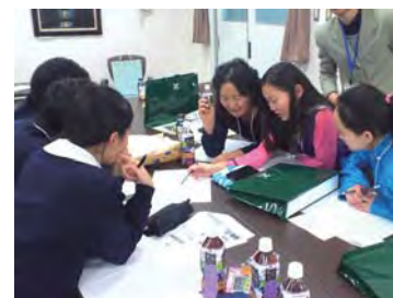
Interactions with Japanese high school students

and photovoltaic power generation, and Japan’s first facility for biomass energy based on livestock feces and urine, thinking about the possibilities of those technologies in their own country. While participants experienced commu-