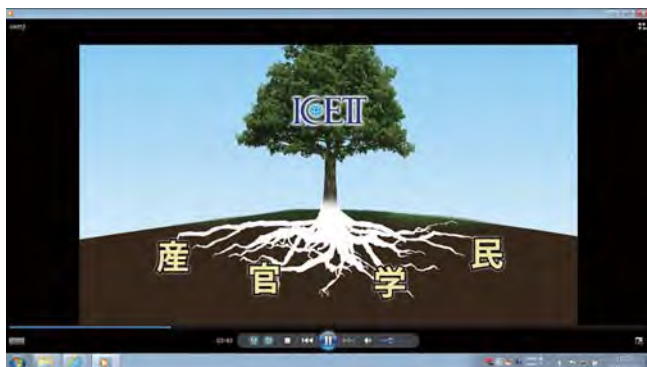
Video that introduces ICETT's activities

In March 2015, the Yokkaichi Pollution and Environmental Museum for Future Awareness opened in front of Kintetsu Yokkaichi Station. A visit to the museum will be scheduled in training programs and study tours of ICETT in the future, and the Museum, through its cooperation, can be utilized to more broadly inform the residents of Mie Prefecture about the historical background of the Yokkaichi pollution problem and ICETT's international activities.