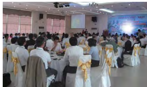
Seminar and business negotiation event in Binh Duong Province in Vietnam