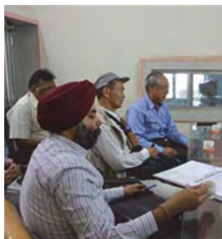
Interview survey in India (Survey on issues & needs)

In mid-April 2014, we visited five model plants in Bhavnagar in Gujarat State together with Japanese specialists and Indian technical experts, and extracted energy-saving improvement items through a survey on present issues and future needs based on interviews, and a survey on the work progress at the actual sites. In early July, Indian technical experts conducted a survey on the current energy balance. Based on these surveys, under the guidance of Japanese specialists, we formulated an improvement plan for energy saving,