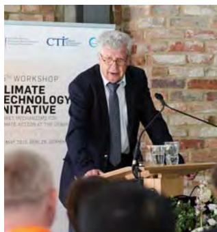
CTI Workshop in Berlin

The CTI Executive Committee's 23rd Meeting was held in Berlin. Delegates from CTI member countries attended and have reported activities of CTI and CTI PFAN, and discussed further expansion of activities. During the Executive Committee meeting, Dr. Barbara Hendricks, German Federal Minister for the Environment, Nature Conservation, Building and Nuclear Safety, joined the CTI Executive Committee, and welcomed CTI members to the historical city of Berlin and congratulated the CTI on its 20th anniversary. The