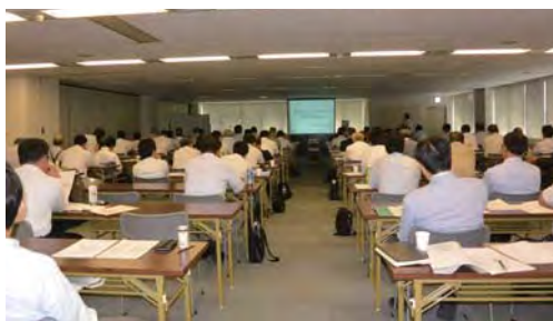
Industry-academia collaborative seminar (ceramics field)

We held the "Industry-academia Collaborative Environmental