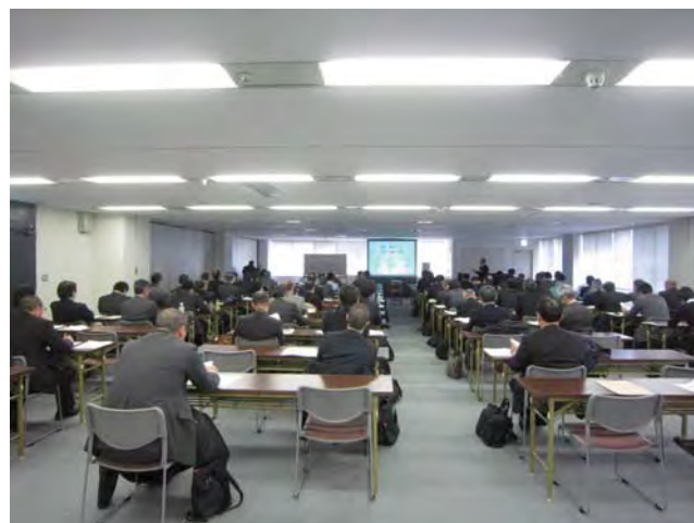
Industry-academia Collaborative Environmental Business Seminar