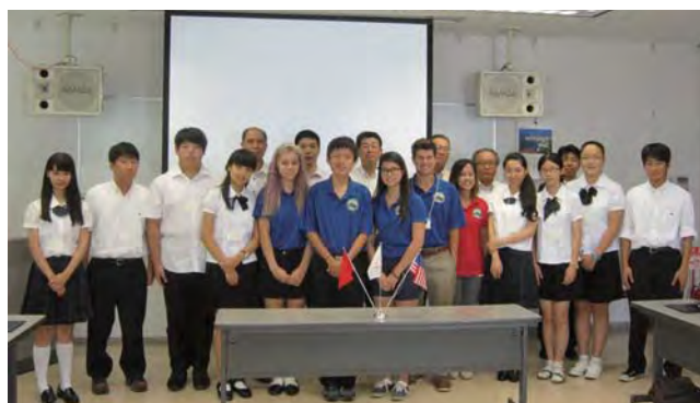
Presentations of achievements in the Environmental Summit in Yokkaichi City features of each city and identification of environmental problems, expressed their opinions with their feet on the ground on what each of them could do to contribute to a recycling society.

In this fiscal year, under the theme “Toward a sustainable recycling society—What we can do,” the Summit was held for eight days from July 28 to August 4 in 2014.