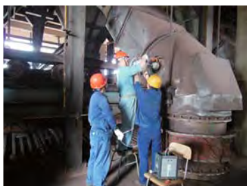
Measuring the amount of emitted pollutants at a model company

After selecting companies as model in Xiangtan City, Hunan Province, related to target fields in the technical guidelines, we measured the amount of emissions of air pollutants, such as NO x , in the production process of the sections which were considered to have larger NO x emissions. Based on the data obtained from the measurements and