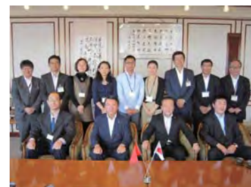
Courtesy Visit to mayor of Yokkaichi City and president of the City Council

After that, receiving support from the Inter-urban Coordination and Cooperation Project, we also held training in Kitakyushu City and Kobe City, cities that have established a friendship-city relationship with Tianjin City. Trainees diversely learned about the actual situation of Japan's air pollution abatement measures, going on a study tour of the Environment Museum and major business establishments, attending a lecture by an environmental consultant in Kitakyushu City, attending a lecture on Kobe City's efforts, and going on a study tour of a waste incineration plant and facilities related to biogas. In addition, we provided practical training content directly related to business, such as study tours of an automobile inspection station, facilities related to biomass, and a coal-fired power station.