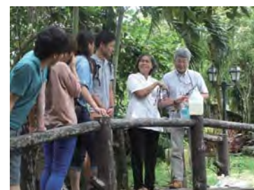
Practice of pack test at the Ministry of Natural Resources and Environment

Resources-Environmental Management Bureau, made a presentation on NGO/NPO activities in Japan, and exchanged information. In Mandaue City, Cebu Province, the participants' next destination, which is located next to Sebu City and used to be labeled a dirty city, active environmental administration is advanced by persons in charge of the environment.