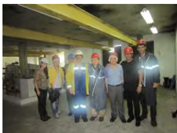
Sao Paulo Water and Sanitation Company (SABESP)

Sao Paulo State in Brazil, where many (more than 1.5 million) Japanese Brazilians live and where activities of people from Mie Prefecture are remarkable, has a deep relationship with Mie Prefecture, and concluded a friendship agreement with the prefecture in 1973. In 2012, the state marked the 100th anniversary of the settlement of immigrants from Mie Prefecture to Brazil. In August 2013, a mission, with the governor serving as the leader, visited Sao Paulo State, and signed the Declaration to Commemorate the 40th Anniversary of the Sister Relationship, which aims to develop the conventional "friendship relationship" into "economic exchange." The prefecture has engaged in mutual exchanges and cooperation in four fields: 1. Education, 2. Environment, 3. Industry and Commerce, and 4. Tourism. It has also promoted the development of both regions. In such a situation, JETRO (Japan External Trade Organization) established the first "Platform to Provide Local Support for Small and Medium-sized Enterprise Business Development Overseas" for enterprises which collaborate with local governmental and private support institutions, as part of the support for business development of small and medium-sized enterprises.