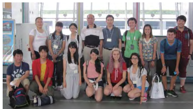
Effort for a recycling society at the port of Yokkaichi

During these eight days, participating students newly deepened their insight into environmental problems from an international perspective by reconsidering their own countries through communal life at ICETT. Also, with one of the main purposes of this project being to deepen cultural and international exchanges, students were able to deepen their interest in and concern for Japan by experiencing Japanese traditions and culture.