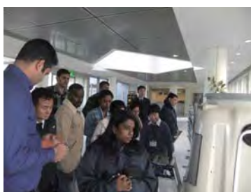
Study tour of a septic tank model

Training participants explored and exchanged opinions concerning the direction of solving problems that they are currently facing related to Japan's administrative systems; environmental laws and regulations, policies, and national and local administrative structures for such elements as air, water quality and waste; and their roles based on decentralization.