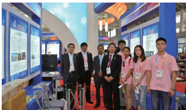
In front of our exhibition booth in Harbin

At the exhibition in Harbin, we held business talks mainly with visitors to our exhibition booth. Additionally, ICETT and one participating company visited Harbin Vocational and Technical College and the Harbin Institute of Technology to demonstrate