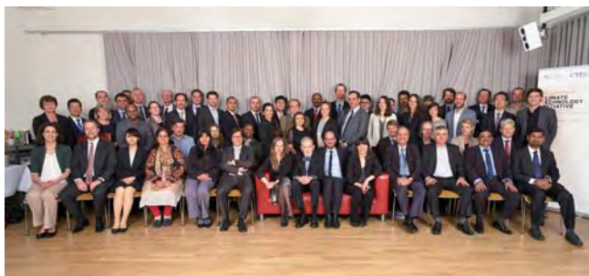
CTI workshop in Berlin

Financing development is one of the major topics in technology transfer under UNFCCC. To facilitate fundraising for implementation of climate change projects in developing countries, the CTI Private Financing Advisory Network (PFAN) has been established by CTI in cooperation with the UNFCCC secretariat and has been making efforts to contribute to the goals of UNFCCC. CTI PFAN has broadened opportunities for fundraising by project developers and entrepreneurs of clean energy, renewable energy, and energy efficiency projects, and fostered technology transfer in developing countries and countries in transition.