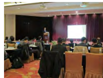
Introduction to technologies of Japanese companies at the Japan-China Technical Exchange Meeting

persons in charge of environmental protection from the central and local governments, including those from the Ministry of Environmental Protection, and persons in charge from companies related to environmental pollution control, and on the