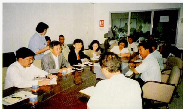
Meeting with a company in Imus City

Imus City is progressing with the procedures for obtaining approval for the ordinance and the plan; at the same time, it is implementing trial programs that are part of these measures. Among these trial programs, Imus city has made a pledge which has unique characteristics and solutions and is worthy of note: It is a pilot project where a general waste composting program is implemented and designated within the city, and after composting kitchen waste from each household, compost is used for home gardening and the like. This is just a small trial and the public administration and residents work together and make an effort to reduce environmental pollutants (kitchen waste) by themselves; therefore, it can be said that this is a concrete example