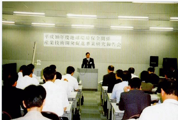
Picture taken at the Research Reporting Meeting (July 6, 1999) for the 1998 Global Environmental Conservation Related Industrial Technology Development Promotion Project