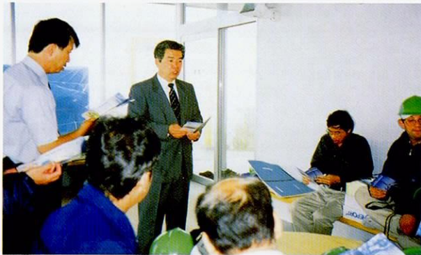
How training is offered

As a part of the training, 8 participants of the said training course visited a wind power generation plant facility located in Aoyama Heights of Hisai City, Mie Prefecture in order to find out the actual situation of the new energy case at site. This training course was intended to give participants the opportunity to learn about the promotion of air environmental conservation and energy saving in industrial and/or public welfare sectors for about 1 month. Participants in this training course showed very high interest in clean energy during the period.