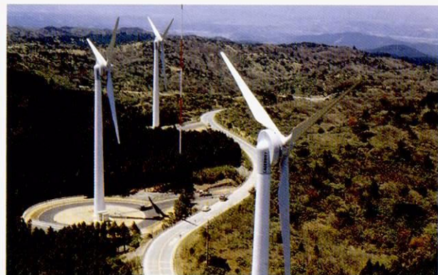
Wind power generation plant in Hisai City

The power generation plant had been imported mainly from Dutch manufacturers. Even Japan, a nation which boasts of its high technology, was confronted with unexpected troubles and failures when the plant was brought into operation under different climatic conditions, and thus this project presented us an excellent example showing the difficulty of actual operation. This project presented a real example which showed participants how difficult technological transfer is from an actual operational point of view. Furthermore, we asked about the public reaction after the plant started operations there and they said that not only were there merits to selling electricity, but also many other effects were produced (i.e. slowly rotating blades matched well with the scenery which became a new symbol of relaxation for the local public as well as visitors and the city became famous nationwide.) This was helping contribute to the revival of the locality. Such information provided valuable motivation to participants for introducing the wind power plant.