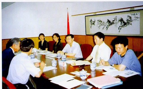
Meeting with our mission in Beijing

automobile exhaust gas recently, and thus the training will focus on automobile exhaust gas. It was also decided that the Planning Commission of the Municipality of Beijing would play a role of main operator as an Executive Committee. Staff of the GAP project of the State Development Planning Commission will also be involved.