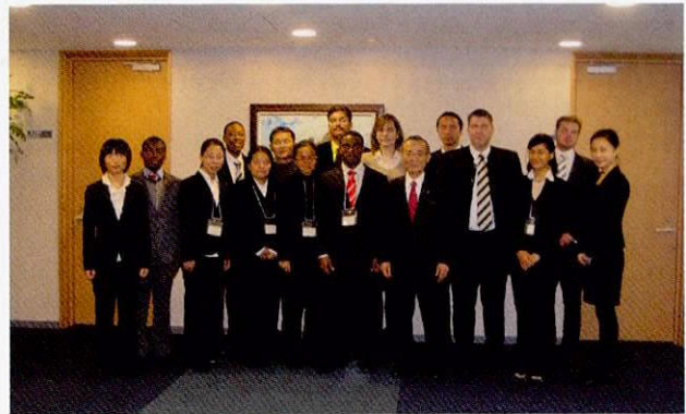
Commemorative photo with Governor Noro