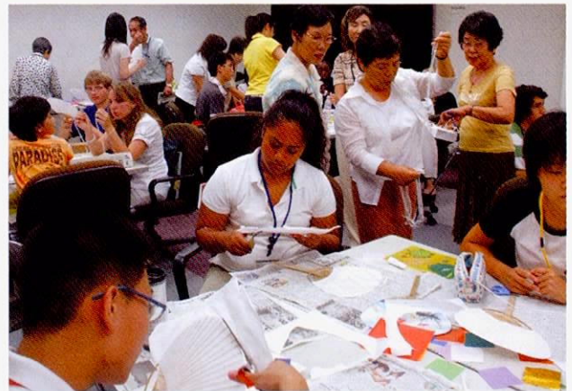
Making bamboo fans to experience a taste of Japanese culture

This workshop offered many diverse experiences that enabled students to directly learn about Japanese culture. They tried their hand at making bamboo fans, applying glue to a bamboo frame with a brush, pasting a sheet of Japanese paper on it and then drying it. Although the work seemed easy, they struggled to complete their fans with the help of members of the Yokkaichi Consumers Association and the Kita-Kawarada Women's Circle, who joined the workshop as assistants. The students also learned how to use Furoshiki, a Japanese wrapping cloth that can be used to wrap and carry objects of any shape. These items represent the original forms of the Japanese traditional eco-style of living, in which use of fans instead of electric fans or air conditioners, or Furoshiki instead of plastic shopping bags is encouraged. Students wrote messages on each other's completed fans and took them back to their home countries. "I will keep this as a treasure for my whole life," said one student happily.