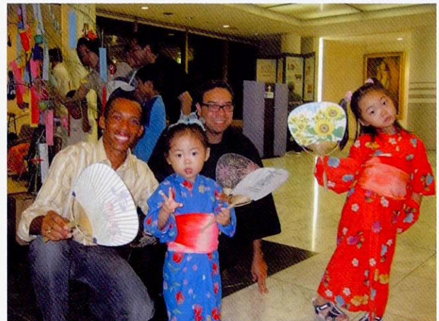
Participants and local children

Enjoying the cheerful night were 32 participants from 27 countries in three training courses, and many Japanese involved. Bamboo branches were decorated with colorful strips of paper on which participants wrote their wishes. After enjoying fireworks, participants from Latin America gave a dance performance. The training program at ICETT offers opportunities not only to learn environmental technologies, but also to discover the cultures and customs of other participants. We will continue to plan various events for mutual exchanges that can attract local citizens and raise their interest in ICETT and the countries of the participants. (Tamura)