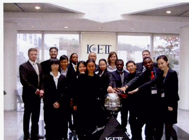
Group photo after closing ceremony

After receiving their completion certificates, the participant students left ICETT in the afternoon and returned to Beppu via overnight bus.