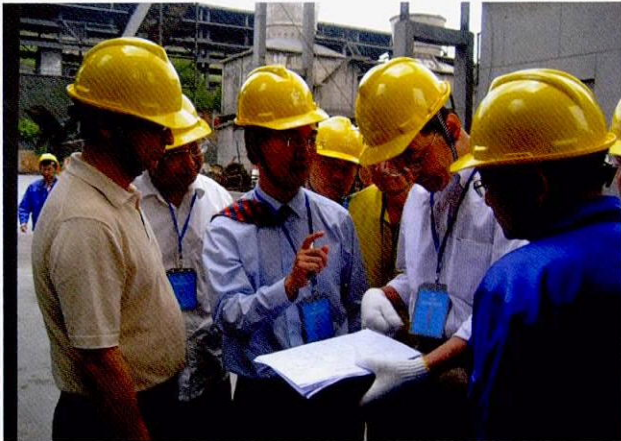
Energy conservation diagnosis at a chemical fertilizer plant

the research, relevant personnel of the plants were interviewed and on-site inspections were conducted, mainly by Japanese expert. After the research, evaluation and discussions were made in the project team on the basis of selection criteria including the simplified energy conservation diagnosis results, motivation and institutional readiness for energy efficiency improvement, scale of energy consumption, potential for energy efficiency improvement and versatility of energy efficiency improvement. Yuntianhua International Chemical Co., Ltd. Yunfeng and Tonghai Chemical Ltd. were then selected as the model plants eligible to receive assistance.