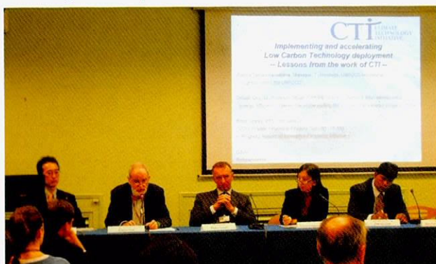
Panelists at the CTI side event

ICETT, having participated in activities of CTI (Climate Technology Initiative) as CTI's international secretariat since 2003, on this occasion held a CTI side event in conjunction with the main conference. The event was attended by government officials, private sector representatives, international organizations, NGOs etc. committed to the issue of technology transfer relating to climate change. Reports on the progress of CTI activities and lessons learned from the deployment of low carbon technologies were presented.