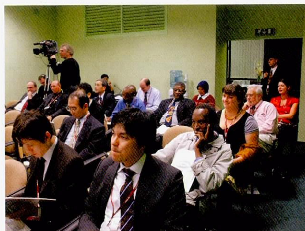
CTI side event participants