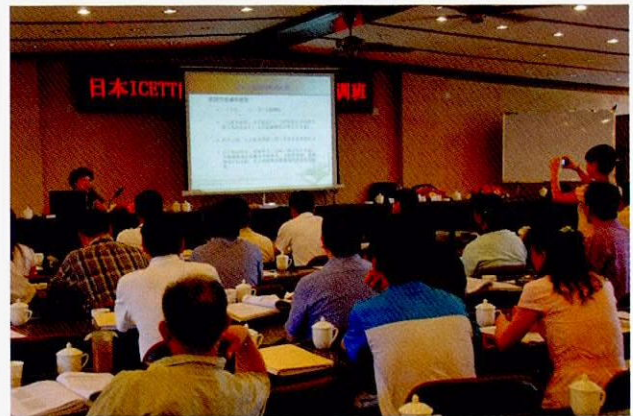
Energy conservation training targeting company management personnel

In the feedback questionnaire collected at the end of training, many participants said that they obtained useful information from the specific explanations on energy saving, thanks to much more practical case studies than those in any other training they had experienced.