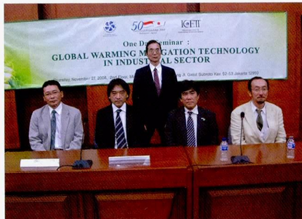
Seminar in Jakarta in November 2008 Four Japanese lecturers and the ICETT Executive Director