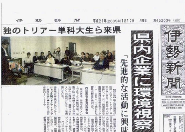
Jan 12 Ise Newspaper, as the top article