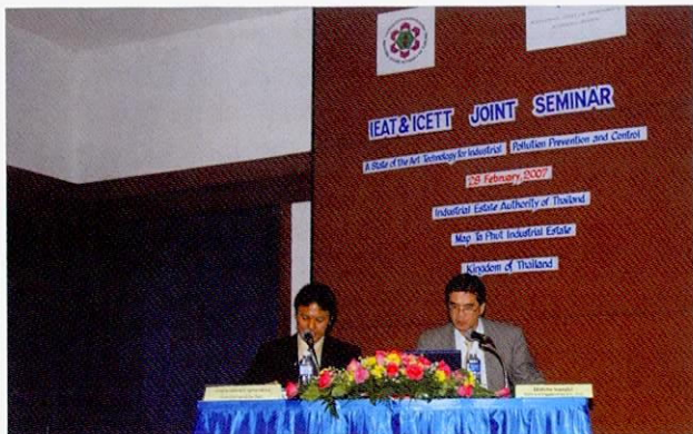
Seminar in Thailand February 2007

In November 2008, ICETT co-hosted a R&D Seminar in Jakarta, Indonesia with the Agency for Industrial Research and Development (AIRD) of the Ministry of Industry (MoI), Indonesia, commemorating the 50th anniversary of Japan-Indonesia friendship. 150 participants attended the meeting.