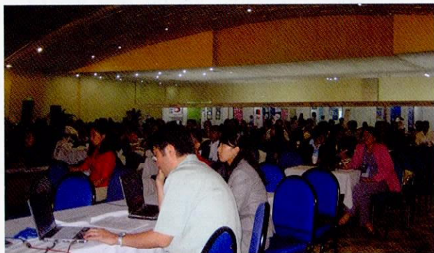
Seminar in the Philippines in February 2008.

In 2007, other meetings were held in Map Ta Phut, Thailand (February) and in Hanoi, Vietnam (December), participated in by 70 persons. In February 2008, a R&D Seminar was held in Cebu, the Philippines, with 170 participants, at the invitation of Philippine Institute of Chemical Engineers, Inc. (PICHe).