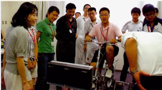
Experiment at Terra 46

To get to know each other, students introduced their cities, ports and schools. Tianjin City, with a population of approx. 10,240,000, is a municipality under the direct control of the central government along with Beijing, Shanghai etc. Facing Bohai Bay, Tianjin City has long thrived as a gateway to the sea. It has enjoyed remarkable economic growth, and further development as an industrial city has been progressed. Long Beach City, a large suburban city with a population of approx. 470,000, is located in the southern part of California State. Facing the Pacific Ocean and having an oilfield, it serves as an industrial port city.