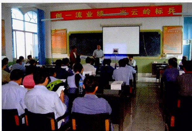
Energy efficiency improvement guidance for chemical fertilizer plant staff

The expert provided the model plants with advice and instructions for more effective improvement, as well as new suggestions for further energy efficiency improvement based on the detailed energy conservation diagnosis.