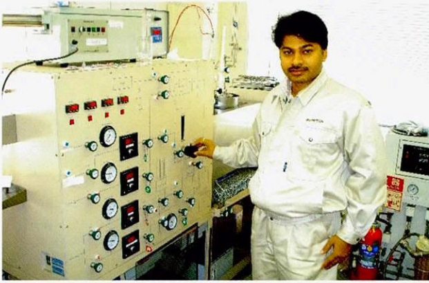
Researcher, Research theme and the Host organization in FY2008