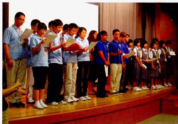
Resolution announced by all participants

Presentations were then given regarding the environmental situation of each city. Students held discussions till late every night in preparing for this presentation. In Tianjin City, air pollution has become a serious problem, especially due to the escalating use of passenger cars, which has had serious impact on human health, as well as on the acid rain phenomenon. The presentation concluded that the development of fuel cells and the dissemination of environmental education would comprise an effective solution to these problems. The presentation on Long Beach City addressed the issues of air pollution, water quality management and waste, and introduced various approaches taken as measures for improvement. As for