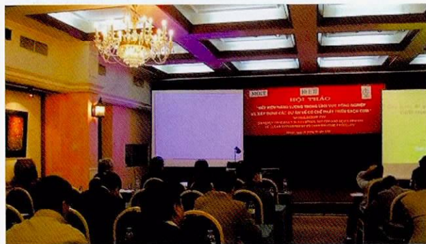
Seminar in Hanoi in December 2007