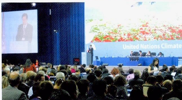
Statement by Saito, Minister of the Environment, at a ministerial conference

From December 1 to 12, 2008, the 14th Conference of the Parties (COP14) to the United Nations Framework Convention on Climate Change (UNFCCC) was held in the historical city of Poznan, Poland, where future schedules were decided regarding the framework for the next greenhouse gas emission reduction agreement at COP15, to be held in Denmark in 2009. UNFCCC is a treaty whose governing organization determines frameworks for international commitment, having as its ultimate objective the "stabilization of greenhouse gas concentrations in the atmosphere at a level that would prevent dangerous anthropogenic interference with the climate system." Under the framework for addressing this challenge that confronts all humankind, the Ad hoc Working Group for deciding the next international framework will at its March 2009 meeting organize the Chairman's Notes summarizing proposals from the member states, upon the basis of which negotiation text preparation is scheduled for the meeting in June.