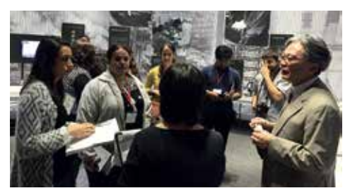
At the Yokkaichi Pollution and Environmental Museum for Future Awareness (Yokkaichi City)

tours, through question and answer sessions, trainees were able to further deepen their understanding of the relevant facilities and technologies.