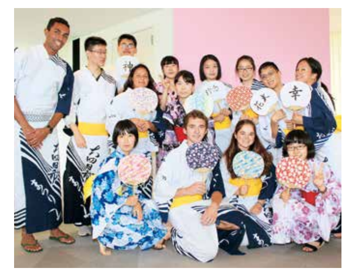
Experience of hand-making a Hinaga Uchiwa fan and wearing vukata

In addition, they were able to increase their interest in and concern for Japan by experiencing Japanese traditions and culture during their visit to the Ninja Museum of Igaryu, and participation in the Grand Yokkaichi Festival.