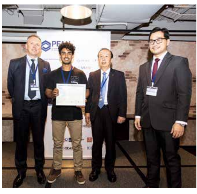
Business developers who received the Winner Award